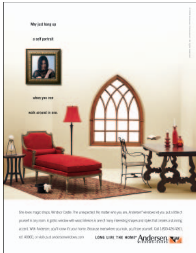
She lives magic shops. Window Code. The unexpected. No matter who you are, Andersen® windows let you put a little of yourself in any room. A gothic window with wood interiors is one of many interesting shapes and styles that creates a stunning accent. With Andersen, you'll know it's your home. Because everywhere you look, you'll see yourself. Call 1-800-425-4251. ext. #0003, or visit us at andersenwindows.com

Andersen has always believed that to be a source of comfort, a home should be worry proof and time proof. Andersen's 1966 invention of Perma-Shield® cladding all but guaranteed this result. Perma-Shield protects the exterior wood and virtually eliminates maintenance.